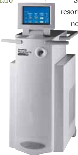
The High Watt Holmium Laser equipment is the only multipurpose Holmium laser that is used for prostate and stone management procedures.